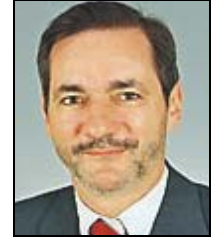
Matthias Platzeck, Prime Minister (SPD)